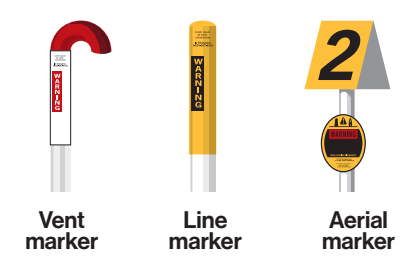
Marker appearance may vary in your area.