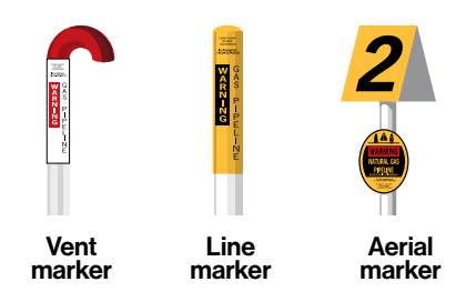
Marker appearance may vary in your area.